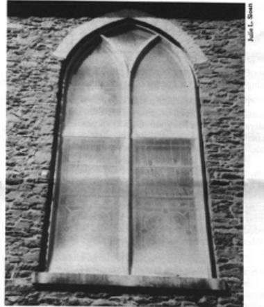
Figure 3: A typical example of polycarbonate protective glazing that has been in place to years. The plastic has yellowed and become occase as a mult of the natural weathering process.

Many churches, synagogues, public buildings, and private homes have had their stained glass windows covered with various types of protective glazing. Many building owners believe the secondary glazing will protect their stained glass windows from vandalism and the effects of air pollution, and also help conserve energy. Protective glazing does have its uses. However, protective glazing is not an alternative to good maintenance and restoration. It will not correct existing deterioration and will not stop the deterioration process. Properly installed protective glazing may lengthen the life of a stained glass window, although this will not be true for all windows. Improperly installed protective glazing, however, will significantly shorten the life of a window and perhaps lead to irreparable damage.